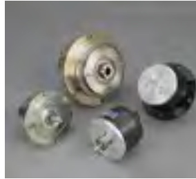
Picture above shows different type of actuators for torque generation