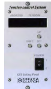
Picture above shows basic tension setting interface for all UCTD series creels.