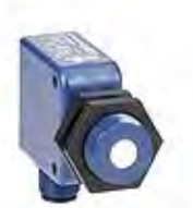
Ultrasonic sensor for diameter calculation