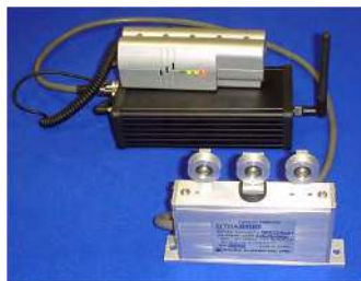
Example of wireless unit